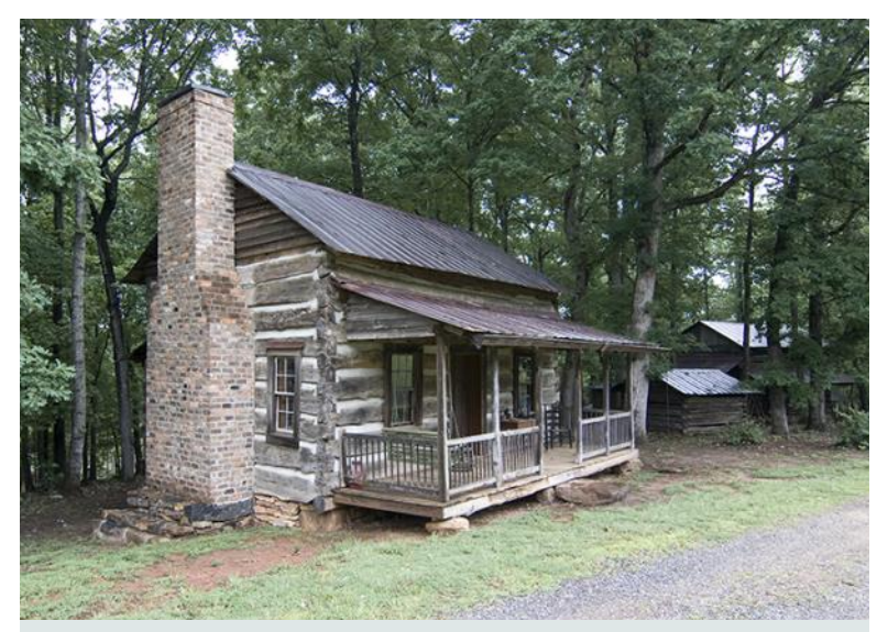
THE BLACKBURN — SUMMEROW — NULL — HARTZOGE HOUSE, Build about 1763